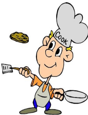
Head Chef Ed Caluori

Come out for great fraternal fellowship along with good food.