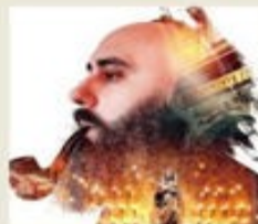
E-KNOCK Catholic Rapper