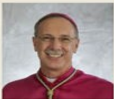
BISHOP RAFAEL ZARAMA Diocese of Raleigh Celebrant